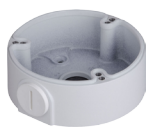
PFA135 Junction box