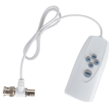
PFM820 UTC Controller