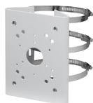
PFA150 Pole mount