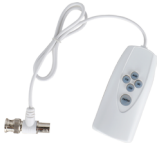
PFM820 UTC Controller