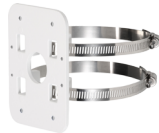
PFA152 Pole mount