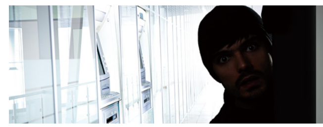
Without WDR Pro