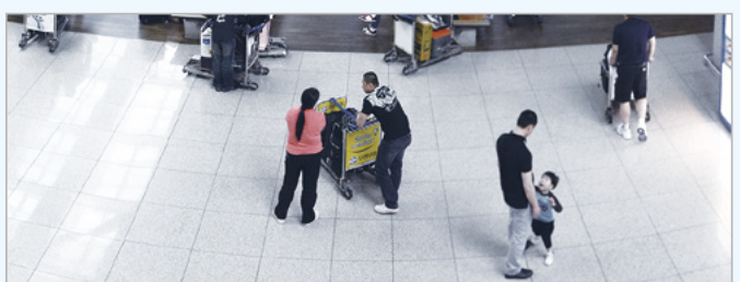
Full HD 18X