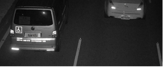
Non-Reflective Vehicle Information