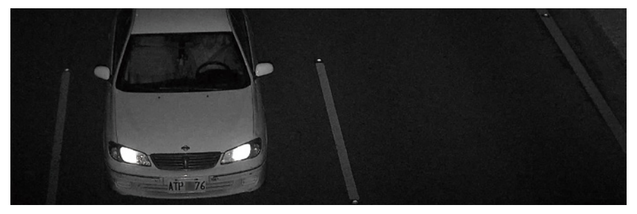
Clear Image Captured with IR Illuminators and Headlight Filter

Capturing images at night is a challenging issue for any surveillance application, but for License Plate Capture applications the challenge is even greater due to noise and glare caused by the headlights of cars. The IP9172-LPC (Freeway) is equipped with external 24W pulse mode IR Illuminators and a delicate headlight filter, which help to filter out reflected light and only capture detailed information from the plates. Moreover, the IR threshold is also programmed to deploy the IR Illuminator automatically to ensure 24/7 & Day/Night performance.