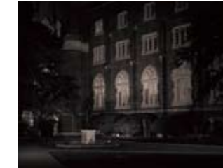
With IR Light

With high sensitivity & day/night function, IP8151 is also capable of campus monitoring. When there are true black areas, IR illuminators can be installed to avoid "black spots" of security. The high sensitivity further increases the range of IR, making IP8151 the perfect choice of campus monitoring.