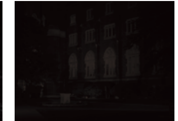
Without IR Light