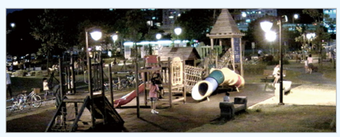
VIVOTEK SNV Camera - Show you true colors at night