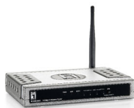
WBR-6003 150Mbps Wireless Router