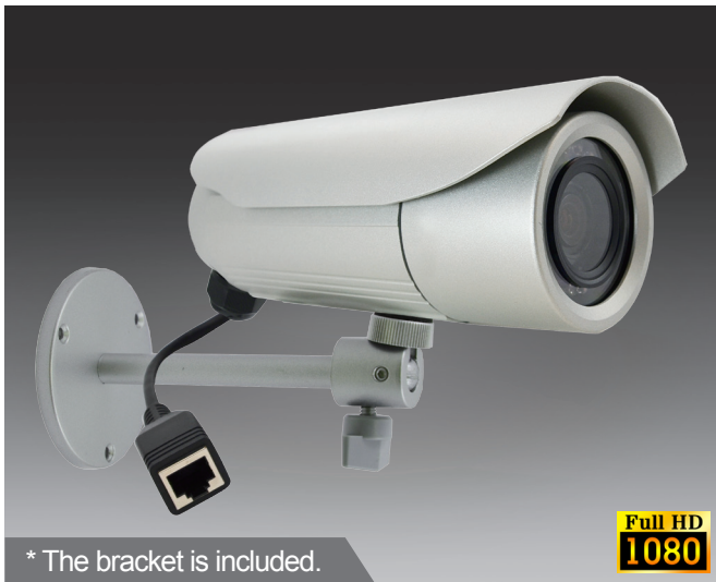
* The bracket is included.

5MP Bullet with D/N, IR, Basic WDR, Vari-focal lens